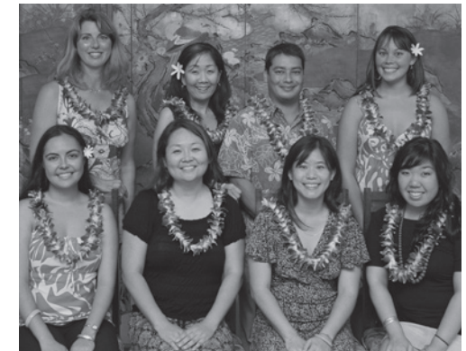
Educators celebrated at last year's ARTS FIRST Honors event