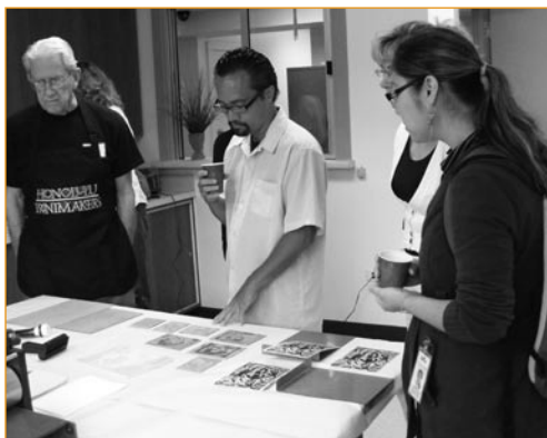
(top to bottom) Participants in youth photography workshop, Going Green by Victor Nhieu, Art activity with the Honolulu Printmakers Guild at Healthy-Bound Chinatown Networking Day